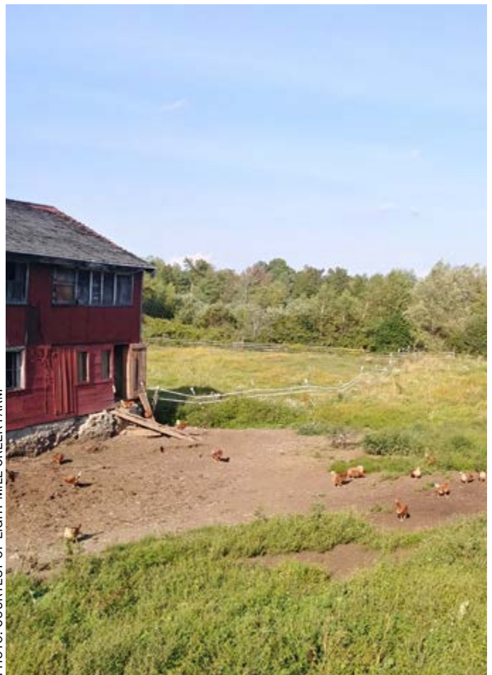
Above: Laying hens at Eight Mile Creek Farm enjoy life without fences and wander wherever their hearts desire during daylight hours.

"I do love what I do," she says, "and I believe in what I'm doing." There's a future, she believes, for a farm like hers. Authentic organic farmers add biodiversity to our whole planet and are a critical part of the global ecosystem.