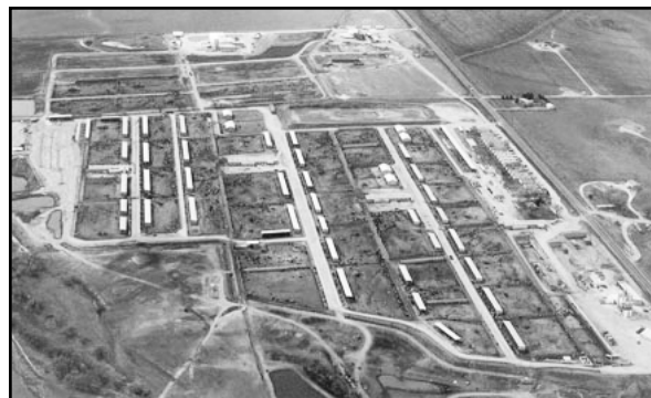
The Cornucopia Institute

Adds Kastel: "Despite 14 'willful' violations of federal organic standards this company, with over $100 million in revenue, was not fined one red cent."