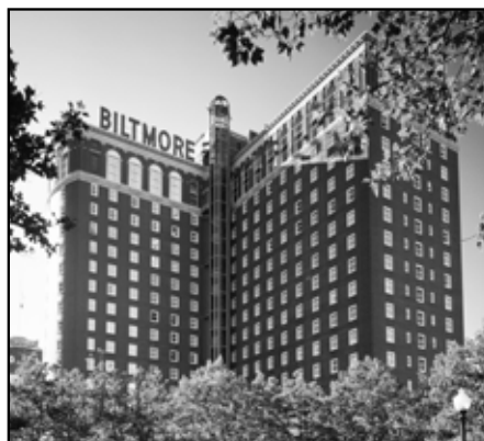
The NOSB met October 15–18 at the historic Biltmore Hotel in Providence, Rhode Island.

The Fall meeting of the National Organic Standards Board marked the Board's 20th anniversary. It could also mark a turning point.