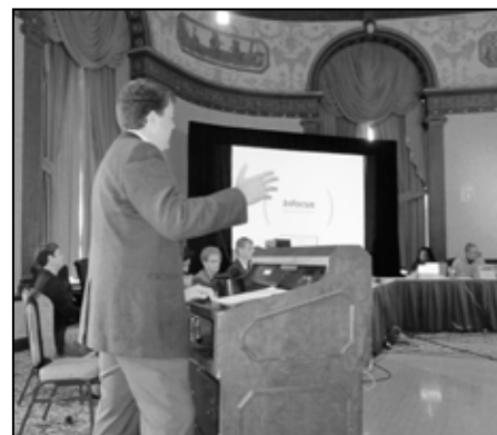
The Cornucopia Institute