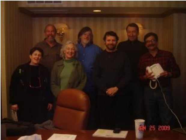
Annual Meeting Attendees